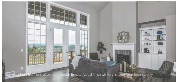
Sample photo from one of our completed homes. Actual finish will vary, shown for reference only.