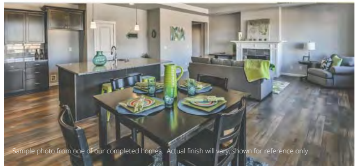
Sample photo from one of our completed homes. Actual finish will vary, shown for reference only.