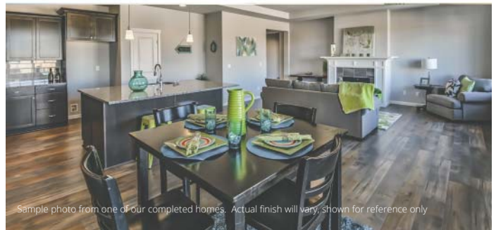
Sample photo from one of our completed homes. Actual finish will vary, shown for reference only.