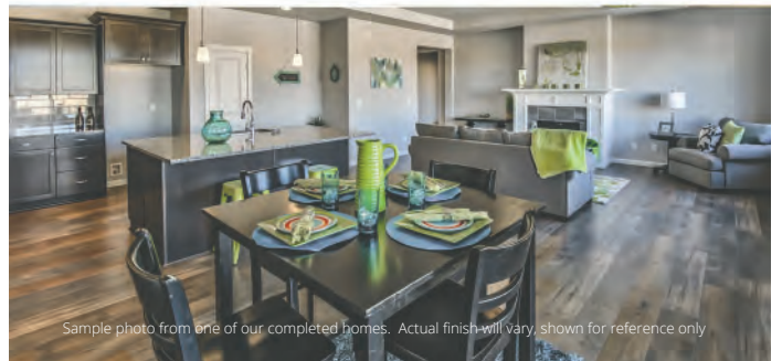
Sample photo from one of our completed homes. Actual finish will vary, shown for reference only