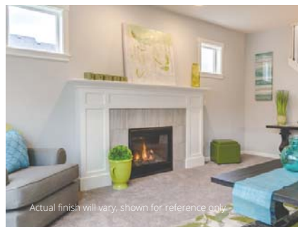
Actual finish will vary, shown for reference only.