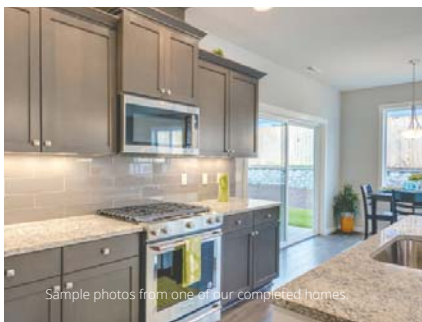
Sample photos from one of our completed homes.