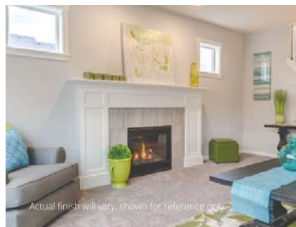
Actual finish will vary, shown for reference only.