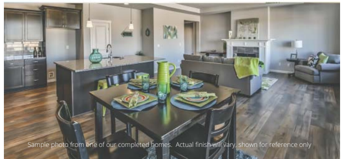
Sample photo from one of our completed homes. Actual finish will vary, shown for reference only.