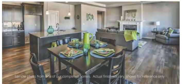
Sample photo from one of our completed homes. Actual finish will vary, shown for reference only