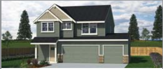
B - 'Chandler' 1753 sf, 3-car garage 3bd, 2.5 ba, Study loft