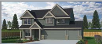
C - 'Arlington-D' 2248 sf, 3-car garage 3bd, 2.5 ba, Bonus, Den