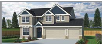
D - 'Arlington-F' 2399 sf, 3-car garage 3bd, 2.5 ba, Den, Bonus