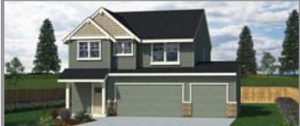
B - 'Chandler' 1753 sf, 3-car garage 3bd, 2.5 ba, Study loft