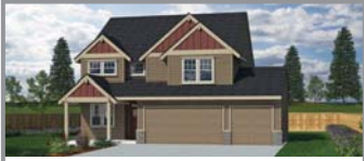
A - 'Avery-B' 2014 sf, 3-car garage 3bd, 2.5 ba, Bonus room